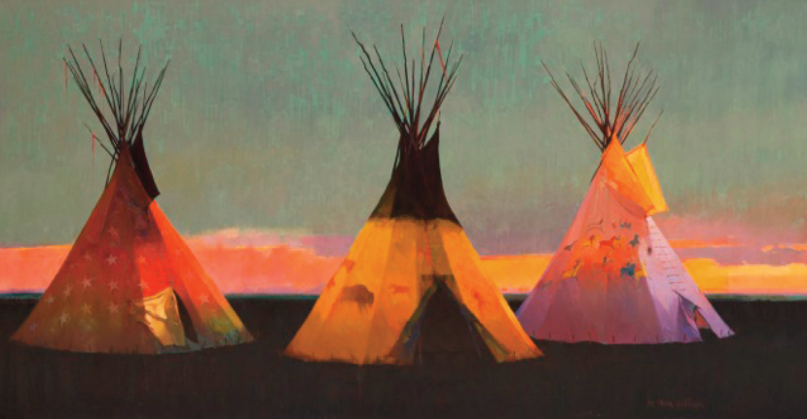
Native Trilogy 2003, Oil on Canvas, 56 x 90"