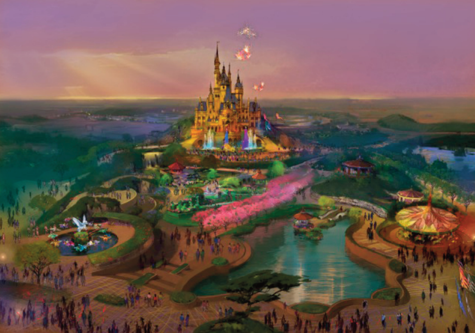
Shanghai Disneyland 2011 Illustration