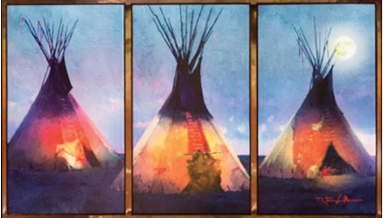
Eternal Triangle 2013, Digital Art, 49 x 86"